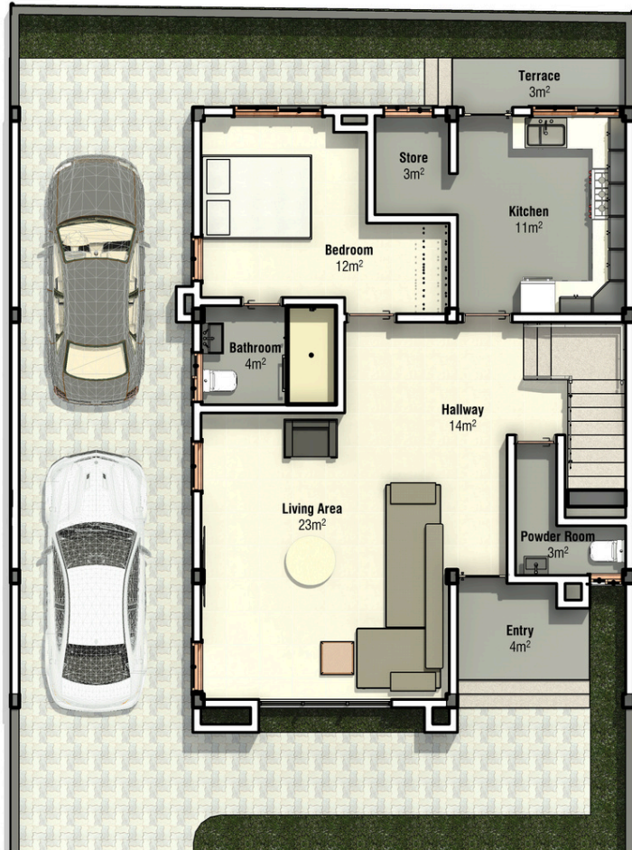
GROUND FLOOR PLAN BUILDING TYPE A (4 BEDROOM TOWNHOUSE)