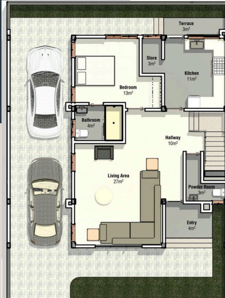
GROUND FLOOR PLAN BUILDING TYPE C (4 BEDROOM TOWNHOUSE)