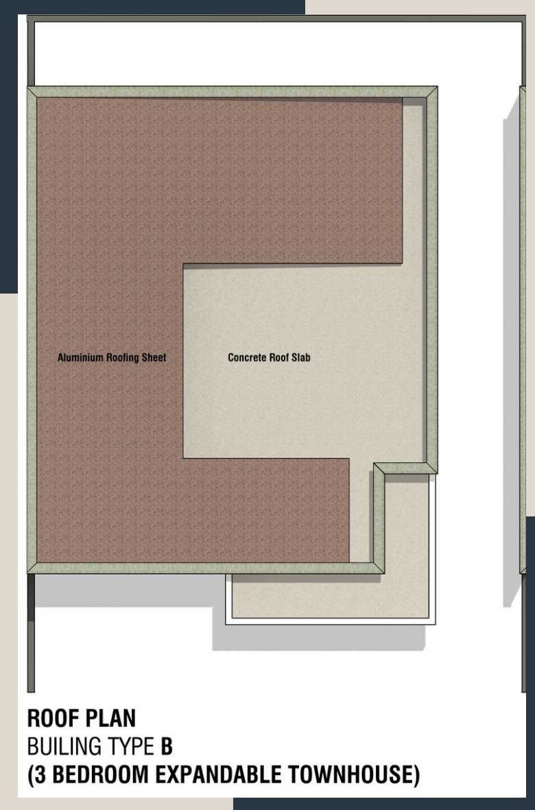
ROOF PLAN BUILDING TYPE B (3 BEDROOM EXPANDABLE TOWNHOUSE)