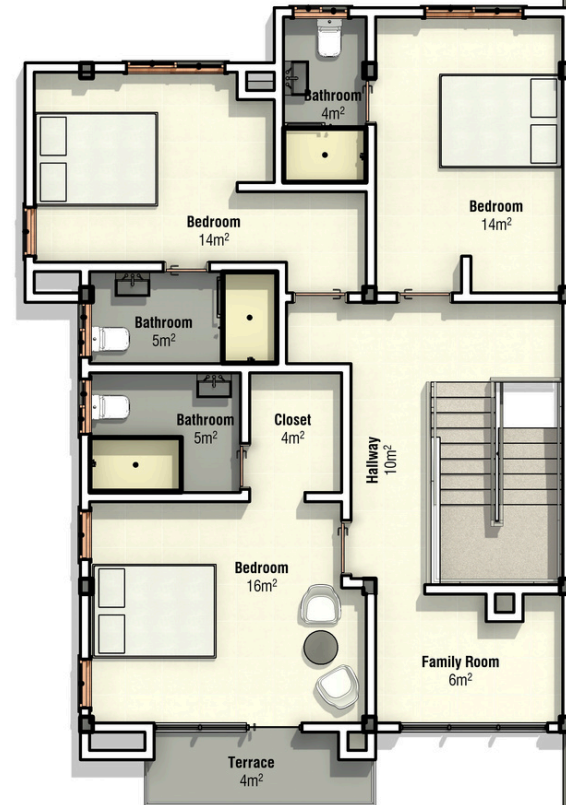
FIRST FLOOR PLAN BUILDING TYPE A (4 BEDROOM TOWNHOUSE)