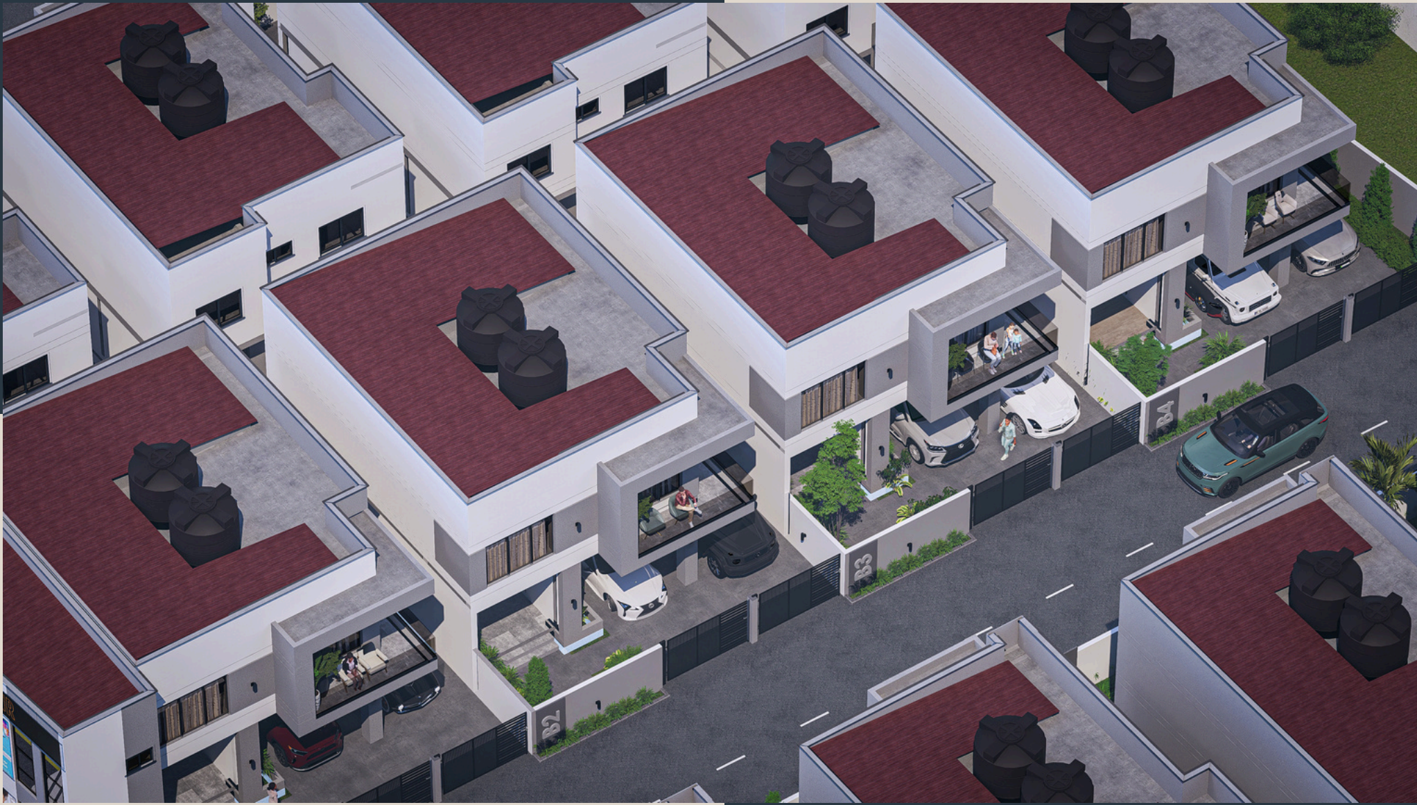
Villa of Modern Living