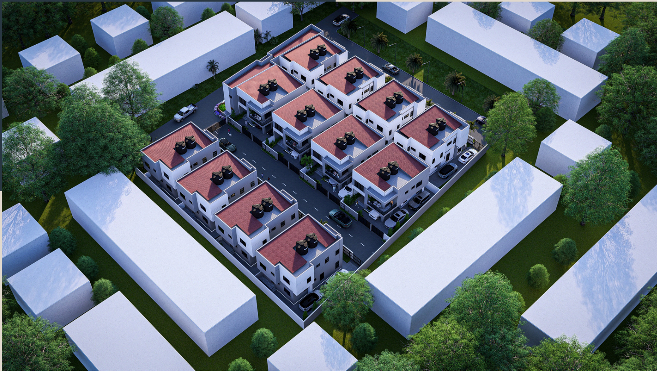
Villa of Modern Living