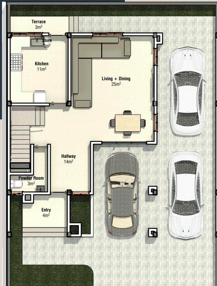
GROUND FLOOR PLAN BUILDING TYPE B (3 BEDROOM EXPANDABLE TOWNHOUSE)