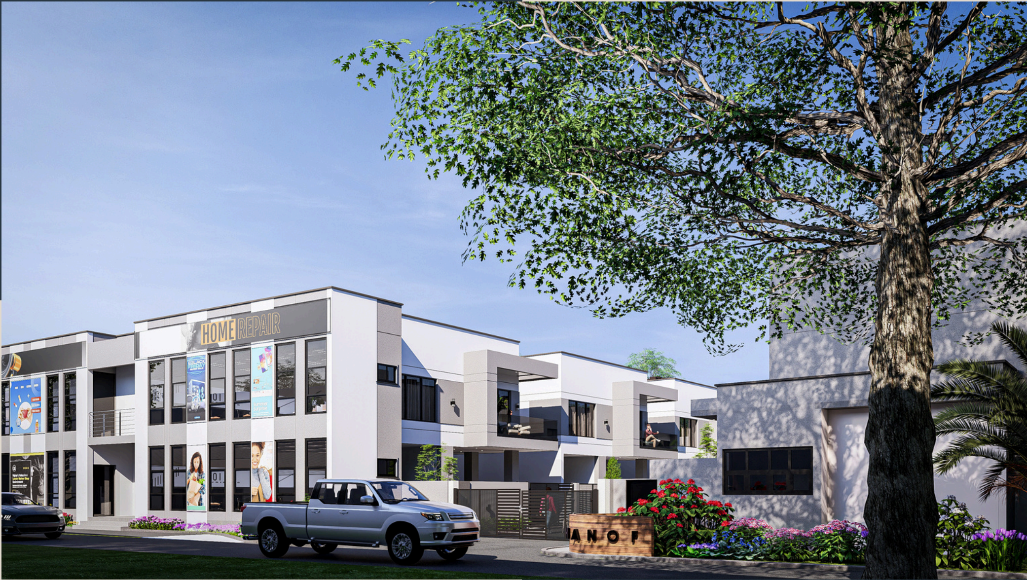
Villa of Modern Living