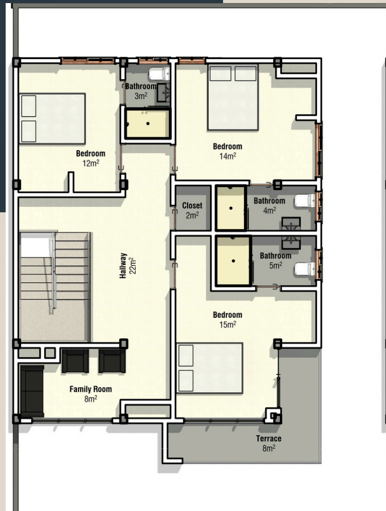
FIRST FLOOR PLAN BUILDING TYPE B (3 BEDROOM EXPANDABLE TOWNHOUSE)